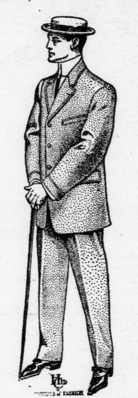
Largest and best equipped Clothin and Furnishing Goods store in the Carolinas. When in the city make our store headquarters

8 and 10 West Trade Stree Chorlotte, N. C.