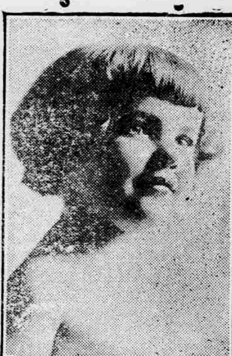
Baby Marie Osborne (Pathe)

Baby Marie Osborne, Pathe's little five year old Mite who has become famous since her first Gold Rooster Play, "Little Mary Sunshine" is to appear at the Hub theatre Monday (Easter) in "Shadows and Sunshine." This is one of the most delightful pictures that has been thrown on the screen in a long time. The many people who saw Baby Marie Osborne in "Little Mary Sun-