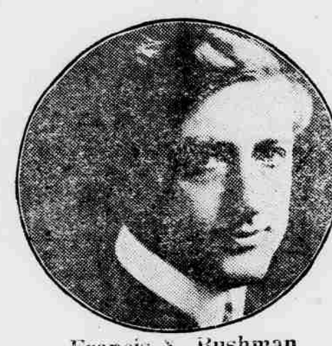
Francis X. Bushman

Home Gardeners and Housewives Can Help "Let me suggest also that every one who creates or cultivates a garden helps and helps greatly, to solve the problem of the feeding of the nation, and that every housewife who practices strict economy puts herself in the ranks of those who serve the nation. This is the time for American men to correct her unpardonable fault of