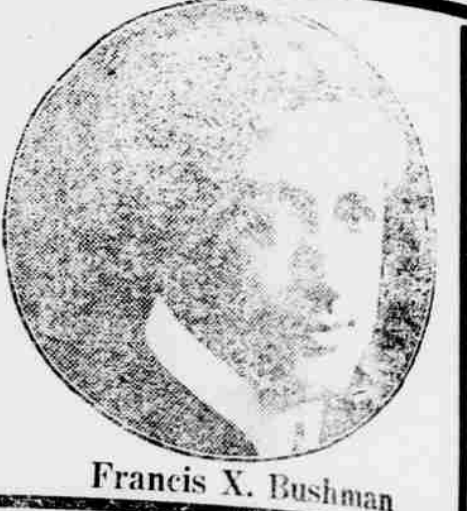
Francis X. Bushman

Special at the Pastime this Afternoon and Tonight. "THE GREAT SECRET." 8th Chapter. Featuring Francis X. Bushman and Beverly Bayne. Also our good "UNIVERSAL PICTURES." Admission 5 and 10 cents.