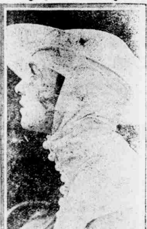
Mrs. Vernon Castle as Patria Channing in PATRIA International Serial