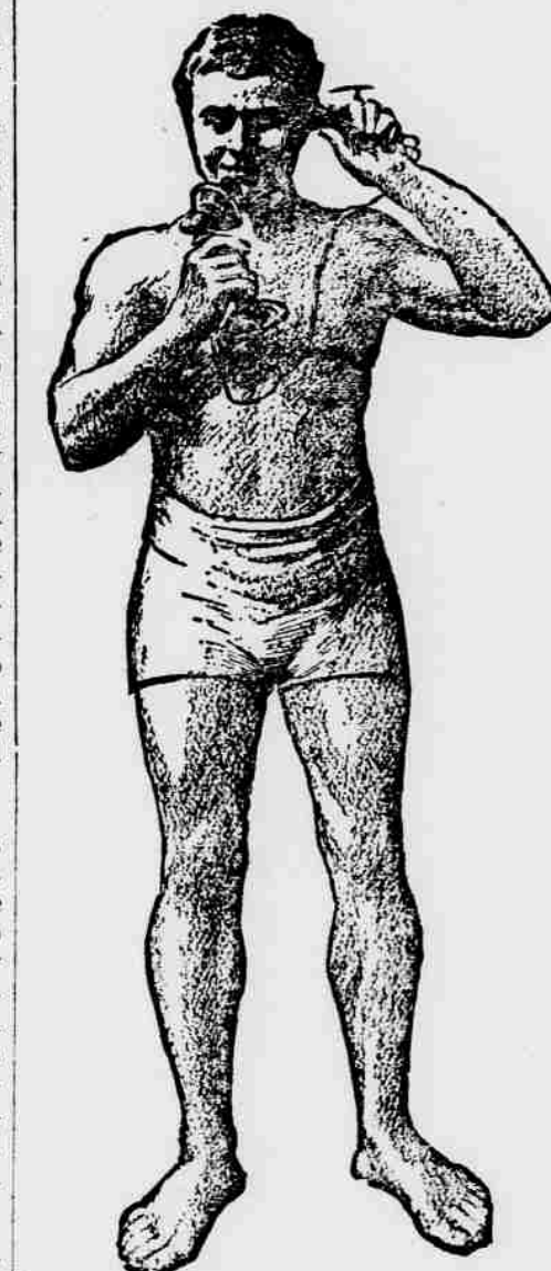
"Iron Man" Receiving Orders

a demand for a new remedy been created in a few days. People who have been unable to retain any solids in their stomachs now declare that they can eat a hearty meal without any discomfort. The most marvelous effect of Ironized Paw-Paw is its wonderful curative power upon the nerves. No better remedy was ever compounded for the stomach and liver; it makes good, rich blood, which in turn strengthens and vitalizes the whole nervous system.