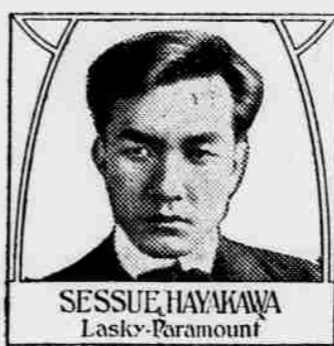
SESSUE HAYAKAWA Lasko-Paramount

TUESDAY, JULY 31st The scenes of "Each of His Kind," the thrilling drama of English and India society life, with Sessue Hayakawa, the noted Japanese actor in the stellar role, which will be at the