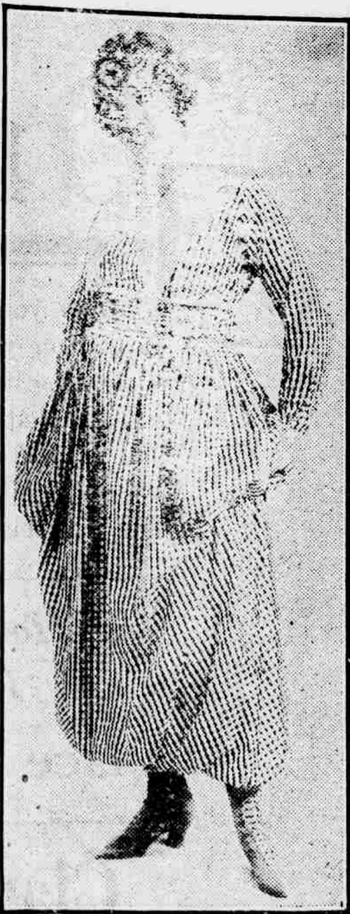
Pearl White, Pathe's Star.

With Inspector for Southern and C. and N-W Railways.