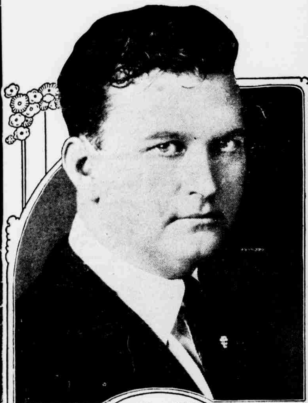
THOS. H. INCE CREATOR OF CIVILIZATION

The Greatest Production of Modern Times IN 9 BIG REELS HUB THEATRE