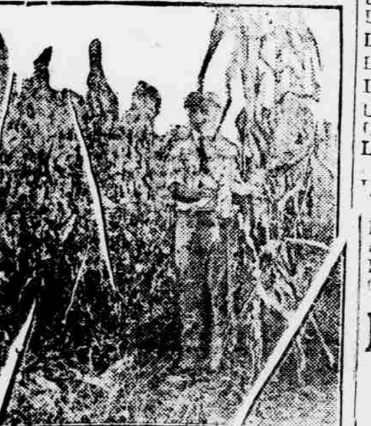
The Time and Place for Selecting Seed Corn.

Every corn grower should go into his fields, when the weather is favorable, and select seed corn for next year from those stalks that are bearing the highest amount of shelled corn.