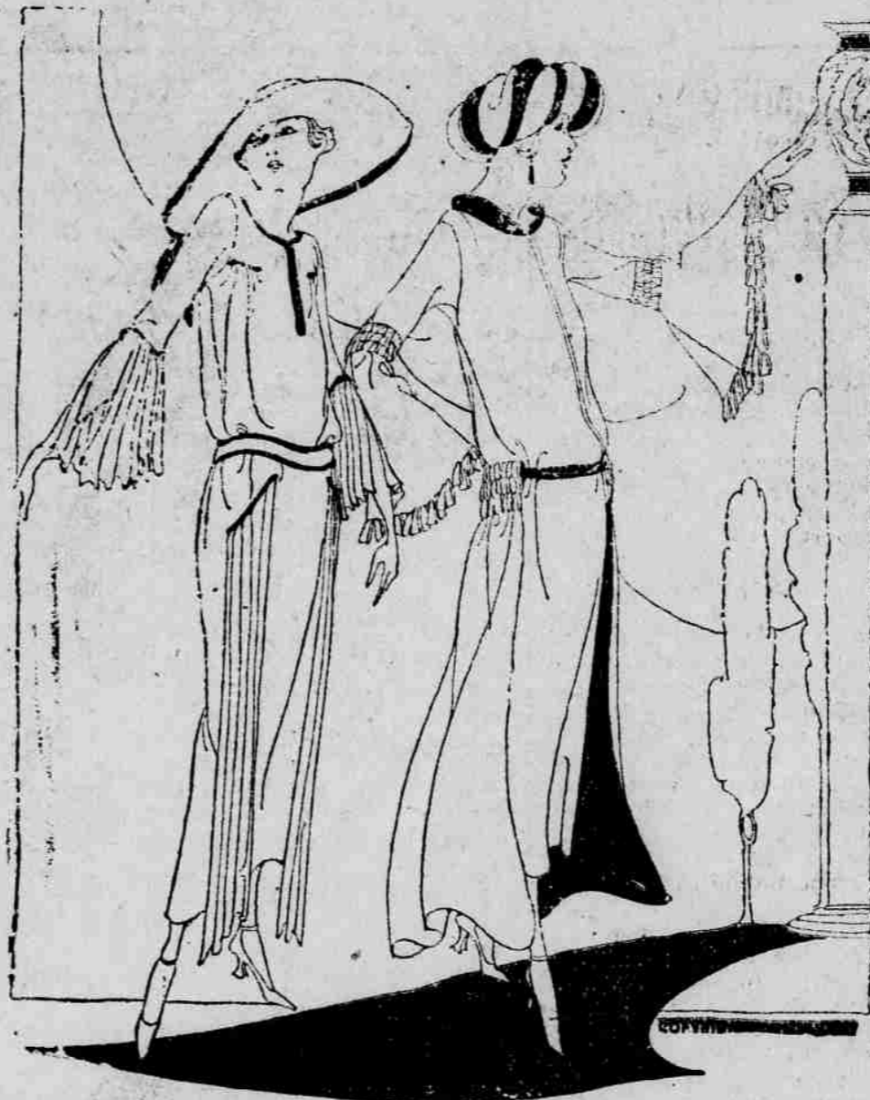
Nearly all the new fall frocks show a growing recklessness of material. Many of them use panels and draperies and sleeves of fine pleating. All are longer and fuller. Embroidery is used to a large extent. Wide sleeves are often lined with brilliant colors.