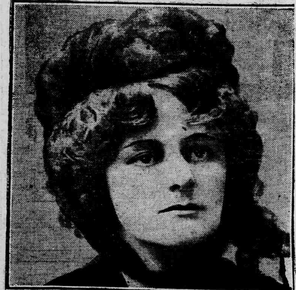
Maudie Gonna MacBride, Irish feminist leader, is referred to by some writers as their Joan of Arc. She recently was expelled from the gallery of the Irish Parliament for heckling speakers of the pro-treaty faction.