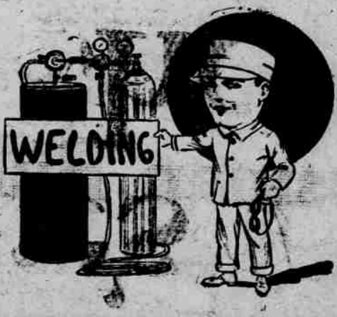
BAKERS GARAGE 9th Avenue, Hickory, N. C.