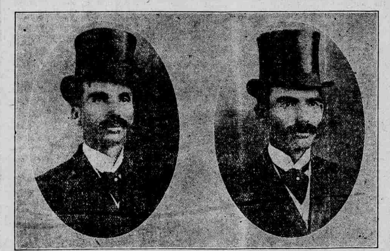
Sale conducted by Penny Bros., the World's Original Twin Auctioneers