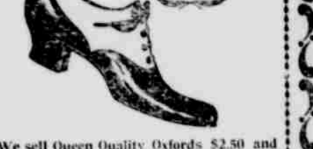
We sell Queen Quality Oxfords $2.50 and $3.00; all the new shapes; see them.

The brightest, the snappiest Spring Shoes produced are here for your selection. Children's, misses' and ladies' Oxfords, Pat. Leather, Bluchers, and Strap.