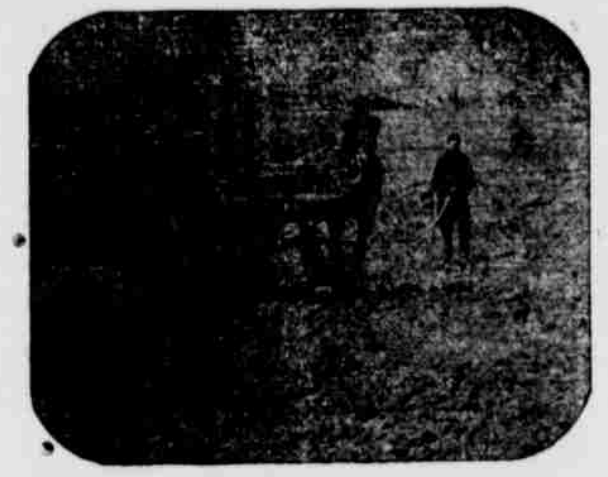
Hauling Freight On This Road Costs 25 Cents a Ton Per Mile.

people marvel what new thing he upon nothing and must therefore come to nothing. Without a permanent business basis not one school manent business basis not one school ween spiritual insight, his histories the next hailed as a patriot, now the next hailed as a patriot, now classed with Danton and Robes the whole people.