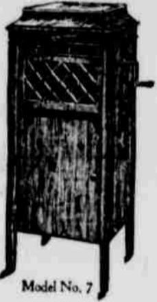
Model No. 7

If you want the very finest phonograph made—you'll choose the Pathe, the Supreme Phonograph. NOW OFFERED UPON MOST CONVENIENT TERMS, which place this wonderful instrument within the reach of all. Every instrument fully guaranteed.