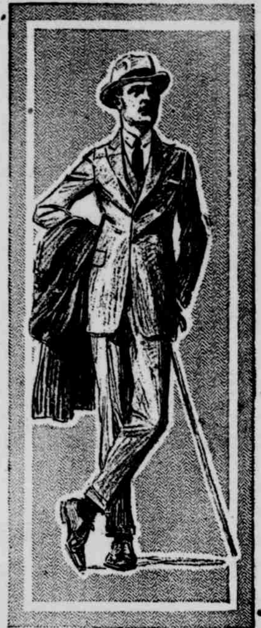
The Stein-Block Co. 1920