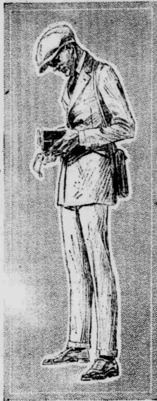
The Stein-Block Co. 1920