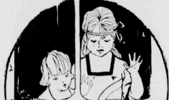
The Aristocrat of the Breakfast Table

Healthful, nutritious and delicious—a rich cane syrup containing all its original sugar. Just enough corn syrup added to give it the desired flavor.