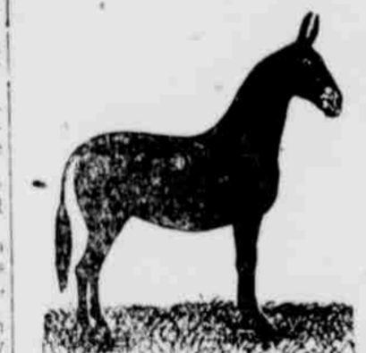
Good assortment of Horses and Mules, Buggies and Wagons on hand at all times. Agents for Kelly Springfield Tires and Tubs. Terms Easy.

old and younger have been registered with the State Department of Health in Raleigh, and the mothers of these babies have received a book on baby care from the State Department of Health. Also twenty-four prenatal have been registered and these expectant mothers have received valuable literature from the State Department of Health. Two hundred twenty-six office or industrial conference with mothers. Group conferences with seventy-four mothers. These on Armistice Day. Health talks to Monroe and Wingate Parent-Teachers Association. We are very proud of the three sets of scales that have been ordered for Monroe and Union county, and are anxiously awaiting their arrival that the work may begin on measuring and weighing the children and finding defaults. We hope soon to start nutritional classes for the under weight children. Most of these schools have been visited by rail. November 23 brought the very much appreciated new Ford coupe which will make visiting in the county less difficult.