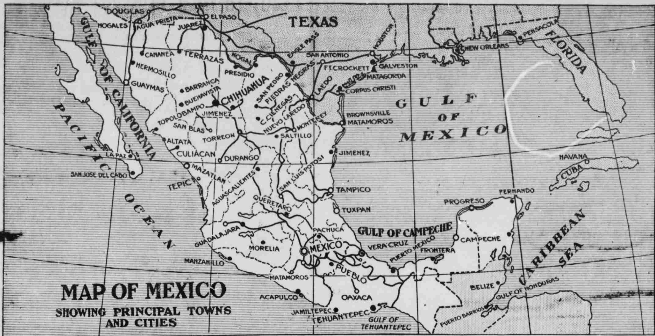
MAP OF MEXICO SHOWING PRINCIPAL TOWNS AND CITIES