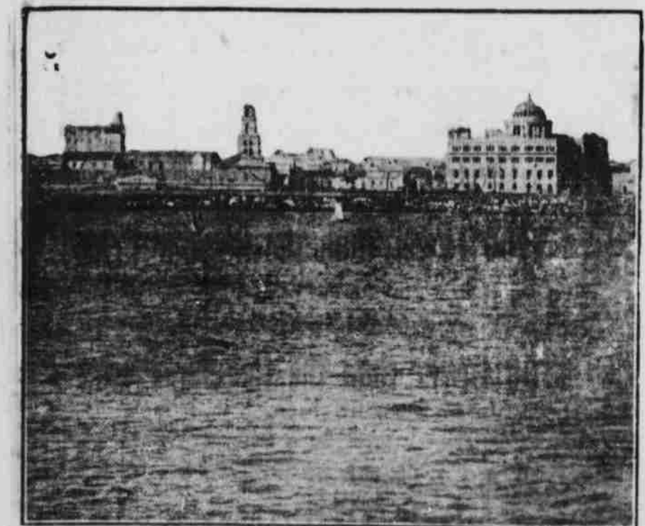
THE water front at Vera Cruz, Mexico, is shown in this picture. Wharfage accommodations are limited, but still the port is the most important on the gulf coast of the republic. It is only four feet above the sea, and its population is about 30,000. It is one of the first places settled by Spanish invaders.