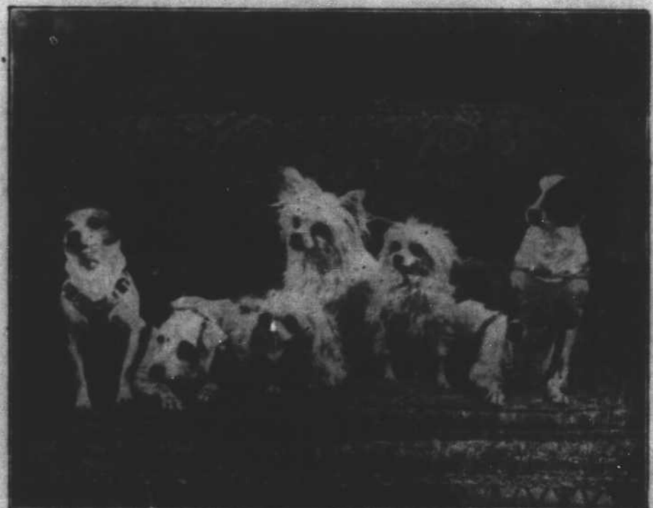
One of the Many Attractive Features at the Fair This Year.