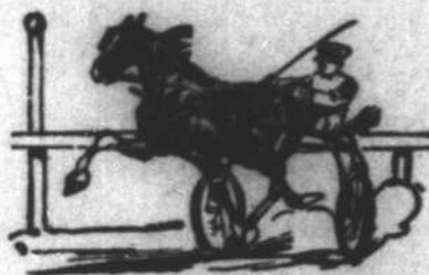
Better Races Than Ever

The large number of entries, consisting of some of the best horses and drivers of the turf, assure visitors of fast, thrilling, close races. The track is in first class condition. The grandstand is large. Everything has been done to make this the most successful meet ever held here.