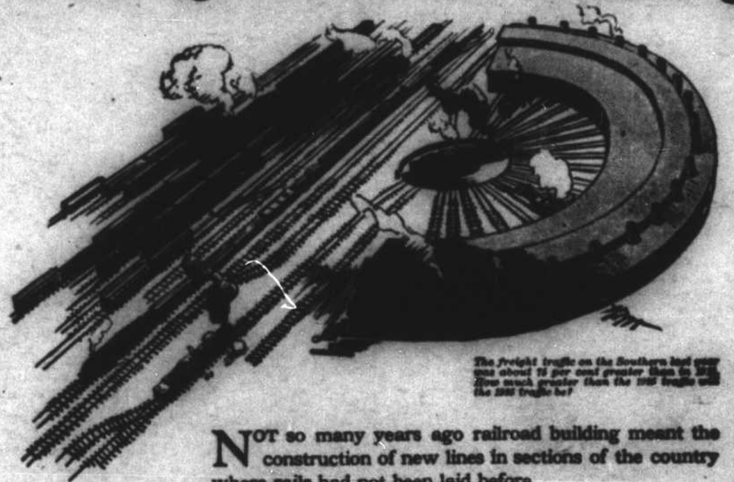
The freight traffic on the Southern had only one about 75 per cent greater than in 1915. This amount greater than the 1915 traffic on the 200 freight cars?

NOT so many years ago railroad building meant the construction of new lines in sections of the country where rails had not been laid before.