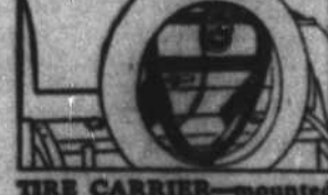
TIRE CARRIER —mounted free from the body rigidly supported by steel brackets.