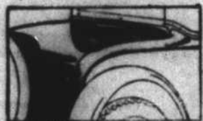
FISH-TAIL MODELING —adds a distinguished sweep to the rear of the Roadster, Coupe and Sport Cabriolet.

No other car, as low in price, offers such features as fish-tail modeling, full-crown one-piece fenders, bullet-type lamps and the like. Come in—and see for yourself!