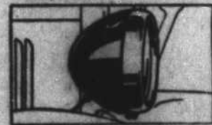
BULLET-TYPE HEAD LAMPS —and cow lamp. Up-to-the-minute in style.