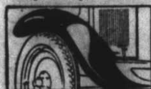
FULL-CROWN FENDERS —(one-piece) which lend substantial grade to the sweeping body lines.