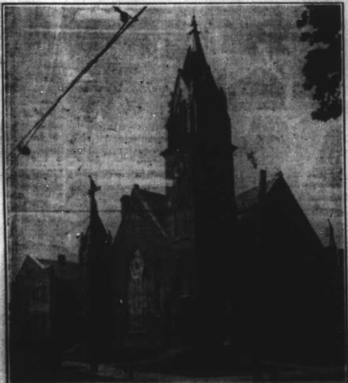
Central M. E. Church, South, Mount Airy. Convention Will Meet Here Friday and Saturday With Banquet Friday Evening Prepared and Served by the Woman's Club.

All the delightful properties of the most expensive imported powder—plus this amazing and exclusive characteristic. A cold cream base that keeps your skin soft and young looking. Use Marcelle Cold Cream Powder for one week and note the marked improvement in your complexion. Marcelle Crème Poudre