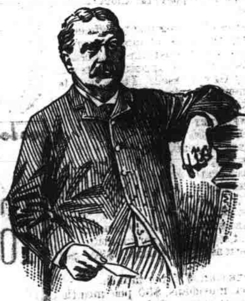
SECRETARY OF THE NAVY LONG.

John D. Long is a native of Maine, a graduate of Harvard, a lawyer, an ex-congressman, an ex-governor of Massachusetts, a translator of "Virgil" and an ex-president of the Massachusetts Peace society. He is 59 years of age.