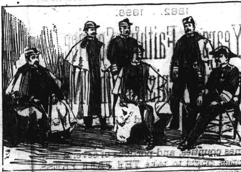
SPANISH ARMY OFFICERS.