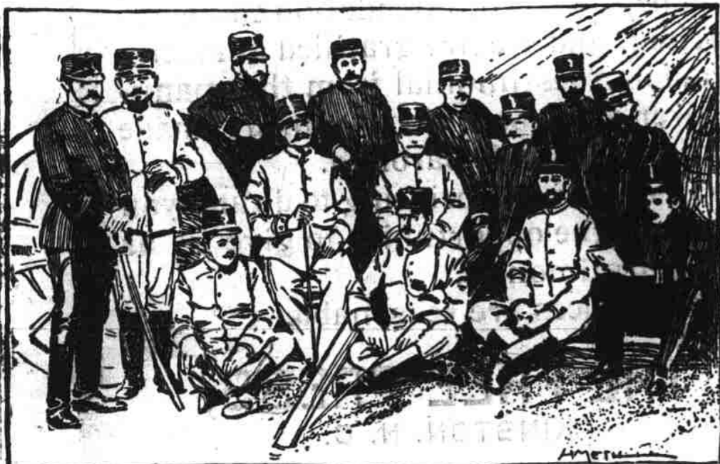
SPANISH ARTILLERY CORPS IN CUBA.