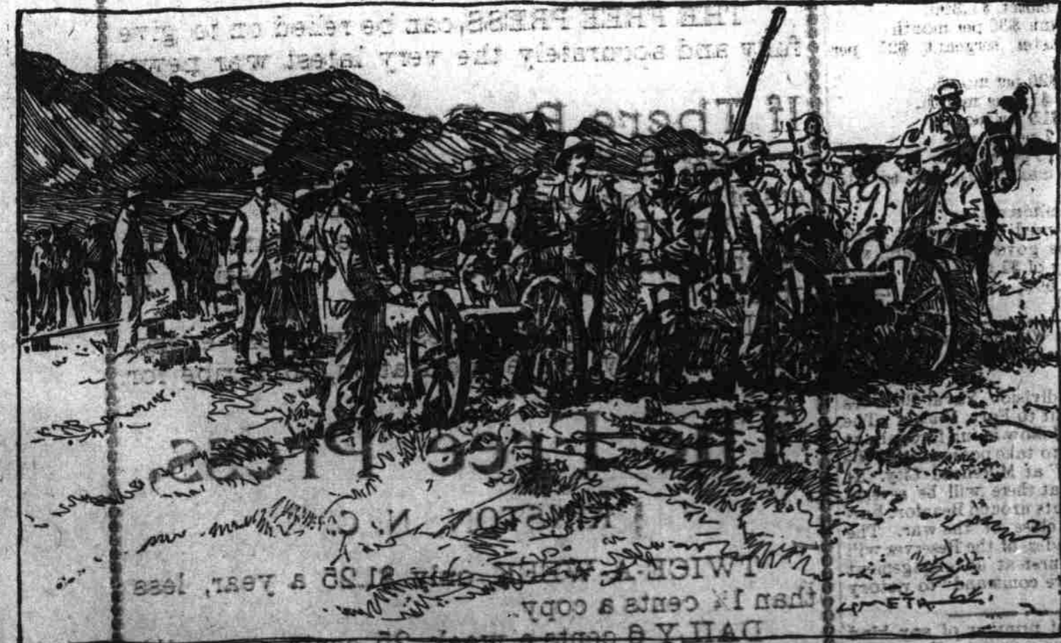
SPANISH ARTILLERY IN THE FIELD NEAR HAVANA.

This fortification lies just inside of the entrance channel to Havana harbor, back of Moro Castle. A once powerful fortress, nothing now remains but its partially crumbled walls of granite. The guns which loom from its parapets and poke their muzzles through the portholes are of such an antique type that a Yankee skipper would laugh at them. The Cabanas has been for years the prison house of Havana, and within its grim cells and dark, slimy casemates have been confined political prisoners and these unfortunate men who formed the Competitor's crew. Hundreds of condemned political suspects and insurgents have been taken from the Cabanas and shot near by.