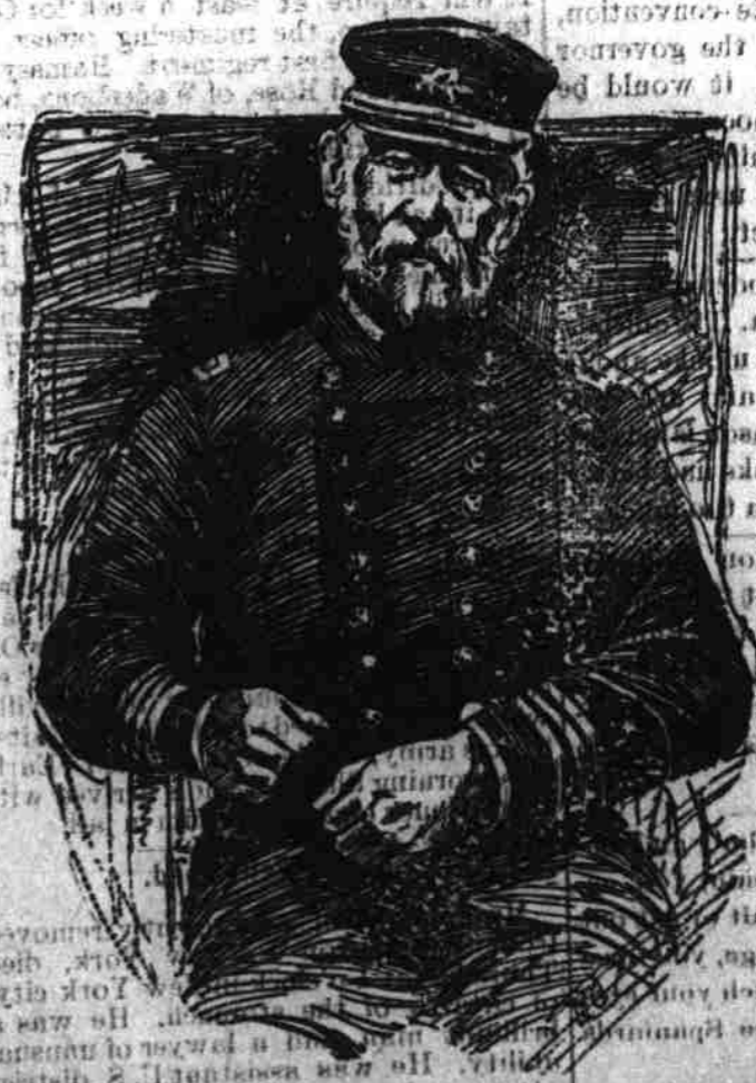
REAR ADMIRAL MONTGOMERY SICARD.

Admiral Sicard is a veteran naval officer and has been under fire scores of times. He is 61 years of age and has been in the navy 46 years.