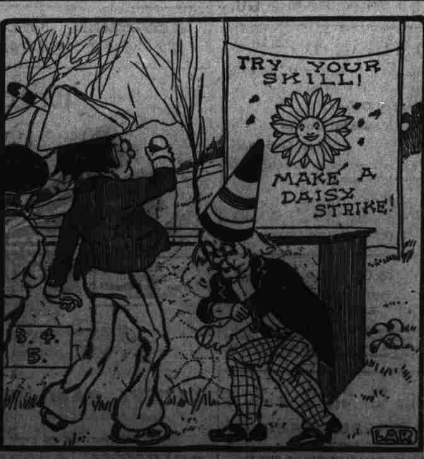
FIND TWO OTHER TEN.

Nicaragus, if There Is a Canal. The construction of the transisth mian waterway through the productive country of Nicaragua means to that the peak of Mont Pelee, where now exists country an opening up of its latent resources, immigration and improved hundreds of fumaroles or miniature transportation facilities. The construction of the canal will draw thousands of foreigners to the country, both capitalists and labor, and it requires no stretch of the imagination to see this increasing population spreading over the adjacent country both to the north and to the south and settling on the lands which can be had for the asking. Where there are now only dense forests, silvery lakes, rushing mountain streams and silent prairies with tall. waving grass there will spring up towns and villages, plantations and farms, and a new geographical and commercial center of the western hem-Isnberg.-Ontlook.