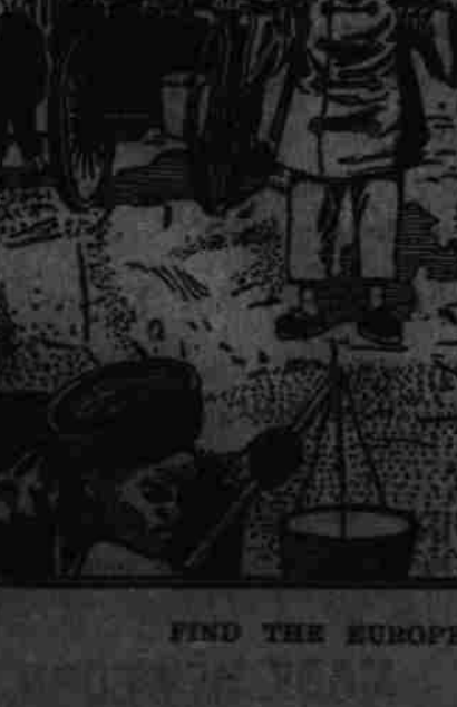
FIND THE EUROPEAN TOURIST.

Business and professional people all over Eastern Carolina should send their orders for printing to THE FREE PRESS. If they will do so they will get neat, tasty and appropriate printing at very reasonable prices.