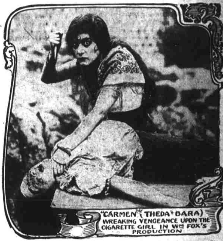
CARMEN (THEDA BARA) WREAKING VENGEANCE UPON THE CIGARETTE GIRL IN WOLFE'S PRODUCTION