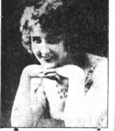
A Paramount Feature—"The Masqueraders"

building will be completed by July 1. It is believed. It is understood that the contractor has promised Abe Schultz, who has leased the first floor for a department store, to have that portion of the structure at least completed by that date.