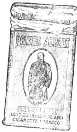
On the reverse side of this label of an open tin will read: "Prince Albert Cigarettes, 1907," which has made three consecutive years where one smokes below!

R. J. REYNOLDS TOBACCO CO., Winston-Salem, N. C.