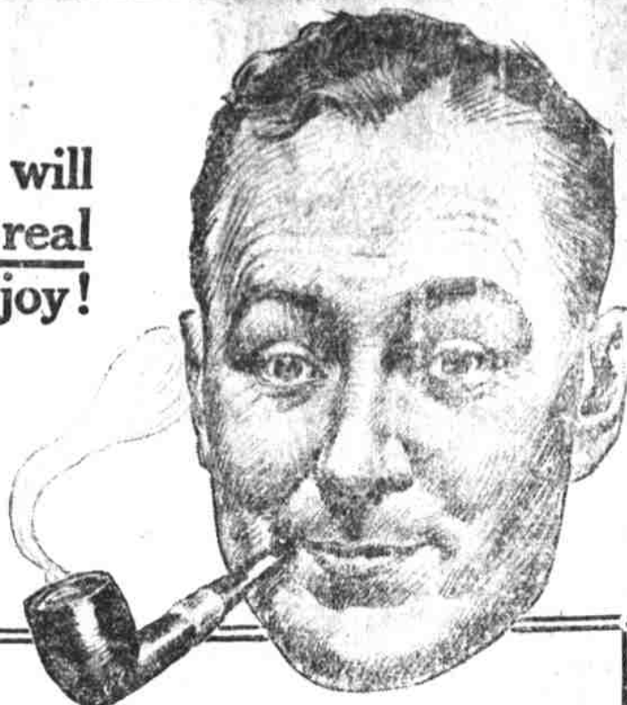
Copyright 1916 by R. J. Reynolds Tobacco Co.

PRINCE ALBERT was made to create tobacco content where it never existed before! It permits men to smoke all they want without getting a sore tongue, without any comeback but real tobacco enjoyment! The patented process by which Prince Albert is made (and controlled exclusively by us) fixes that—and cuts out bite and parch!