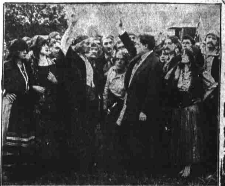
Scene from that Great Fox Feature, "The Broken Law," Featuring the Greatest and Highest Salaried Moving Picture Actor in America, "William Farnum," the $100,000 Star.