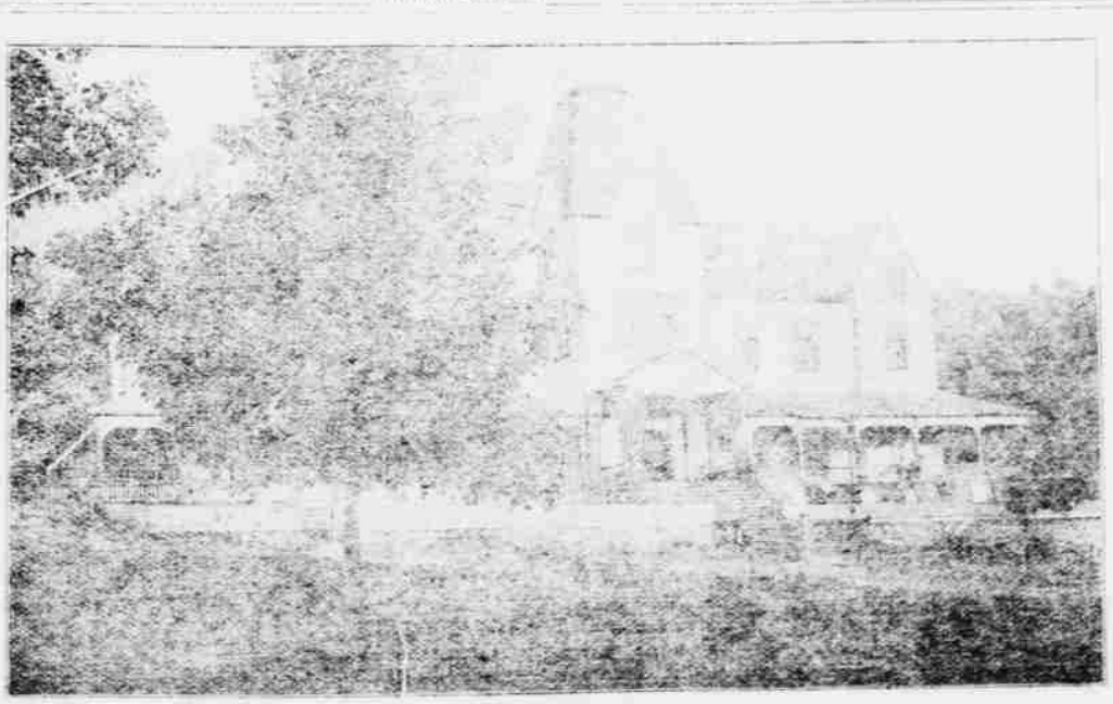
GLEN ALPINE SPRINGS HOTEL