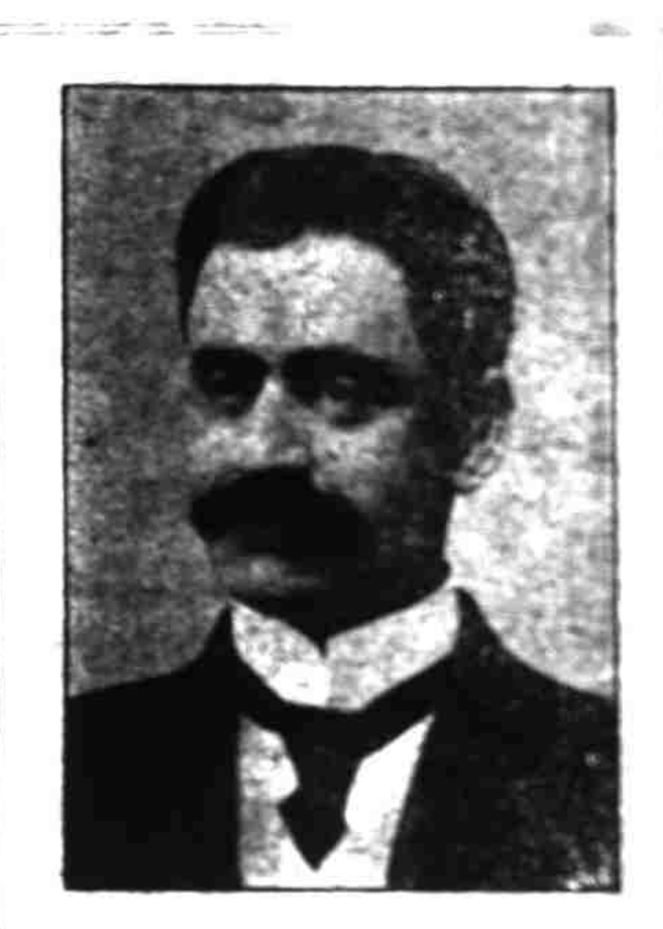
ATTORNEY AT LAW

and growth of the town. With The Manufacturers Club, formerly