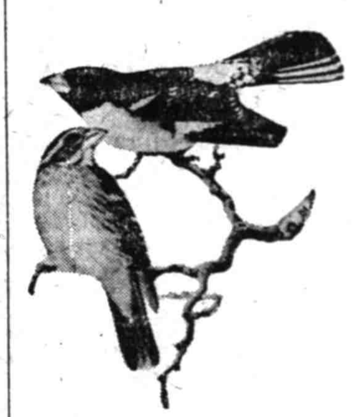
INSECT DESTROYERS GUARANTEED BY UNCLE SAM.

The cardinal or redbird species ranges from southern Mexico. Lower California and Arizona north to Iowa and Ontario and east to the Atlantic coast. They are permanent residents, spending the summer and winter in the same locality. It has been claimed that they pull sprouting grain, but no evidence of damage to either grain or other crops is shown from over 500 examinations. On the contrary, they do much good. They feed on locusts, periodical cicada, the Colorado potato beetle, the rose chafer, cotton worm.