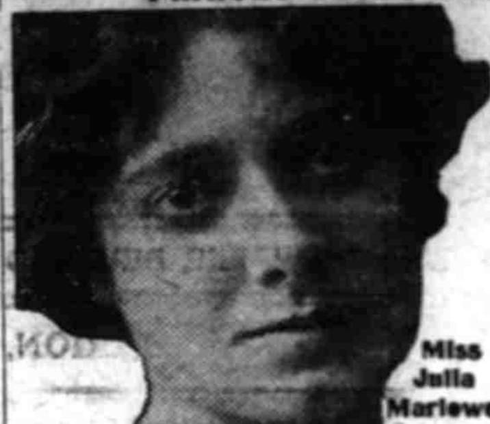
Miss Julia Marlowe

"I am glad to write my endorsement of the great remedy, Peruna. I do so most heartily."—Julia Marlowe. Any remedy that benefits digestion strengthens the nerves. The nerve centers require nutrition. If the digestion is impaired, the nerve centers become anemic, and nervous debility is the result.