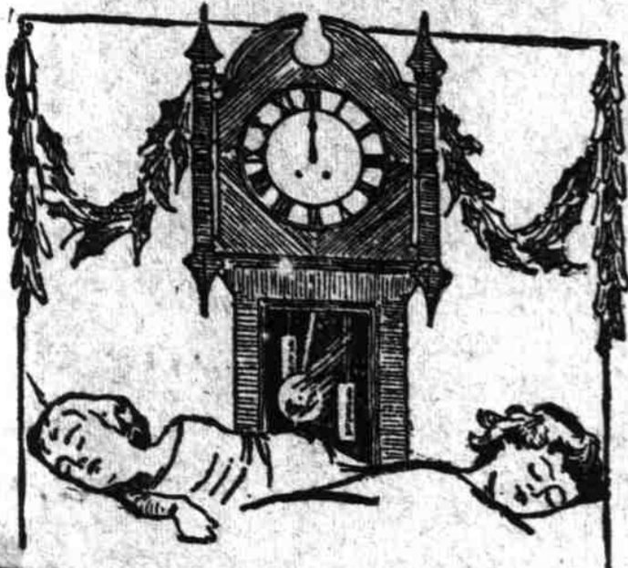
Just at the turn of midnight, When the children are fast asleep, The Old Year slips out by himself, Glad of a chance to be laid on the shelf, And the New Year takes a peep.

Bullocks in English Church. At Emmanuel church, Nottingham, England, considerable excitement was caused among the congregation one Sunday by two bullocks entering while the vicar was preaching his sermon. The animals had strayed from their quarters, and, finding the door open, walked in. They went into the baptistry, but the verger, attracted by the commotion, got in front of the animals, and by gentle and tactful persuasion, drove them out without any damage being done or panic caused.