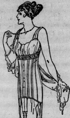
THOMSON'S "GLOVE-FITTING" CORSETS.

We have new Hose for the whole family. We sell Buster Brown and Whittleather Hose. Every pair is guaranteed to give satisfaction. We have new Dress goods, new Bath Robes, New Kimonas, new Curtain goods, etc, etc.