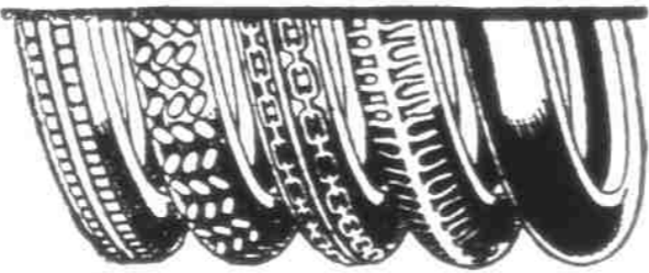
ROYAL CORD - NOBBY - CHAIN - USCO - PLAIN

For best results—everywhere—U. S. Royal Cords.