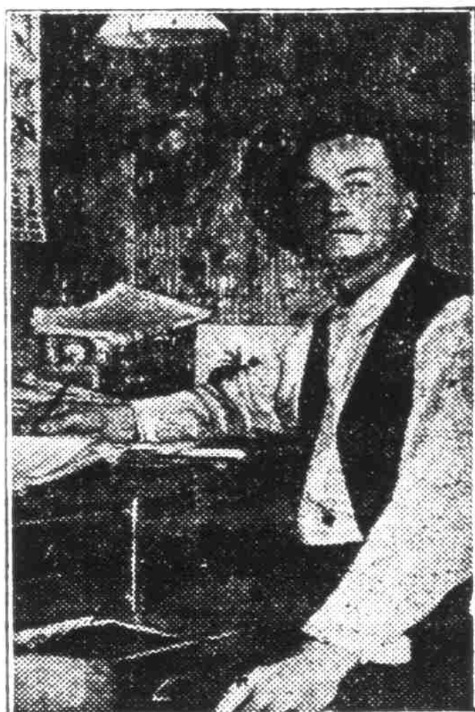
Without Keeping Records the Farmer Cannot Tell How Much He is Making and on What Crops.

The figures given which relate to the labor income will prove most interesting to farm employers. The analysis has reduced the labor cost of farm work to figures. An acre of hay, on an average farm, costs the labor of one man and one horse for a ten-hour day to cut, cure, and harvest it; oats, wheat, and barley, one and a half days of man labor and three of horse;