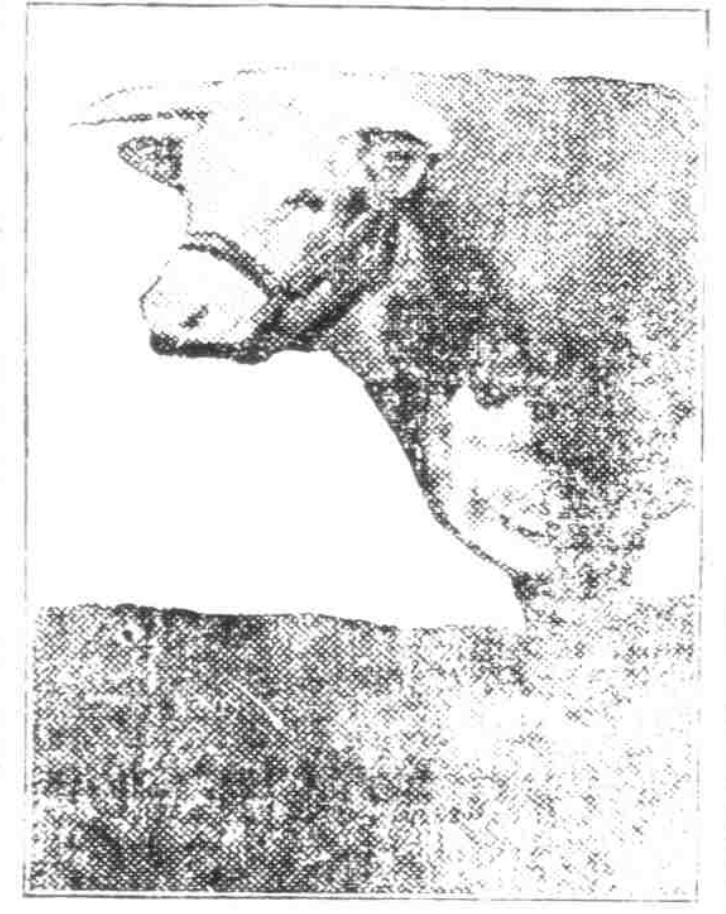
Registered Hereford Bull, Used in Grading Up a Hard.

This statement addressed to the United States department of agriculture by a Texas stockman, who recently, joined the "Better Sires-Better campaign, indicates the eseem with which purebred sires are