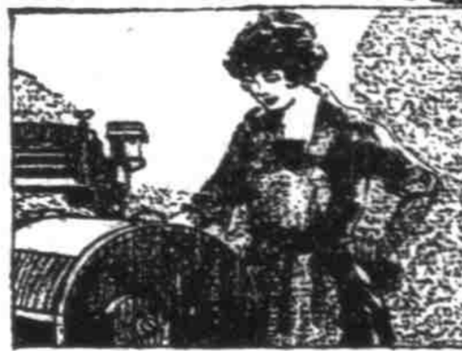
Any woman can get a big day's washing finished way before noon by using a power washer operated with WILLYS LIGHT Certified Electric Service.

Why not investigate WILLYS LIGHT Certified Electric Service now? There's a painstaking, conscientious WILLYS LIGHT dealer-expert near you who will give you a demonstration on your farm without obligation and free estimate of equipment and installation suited to your requirements. The cost is amazingly low and easy terms of payment can be arranged to suit you.