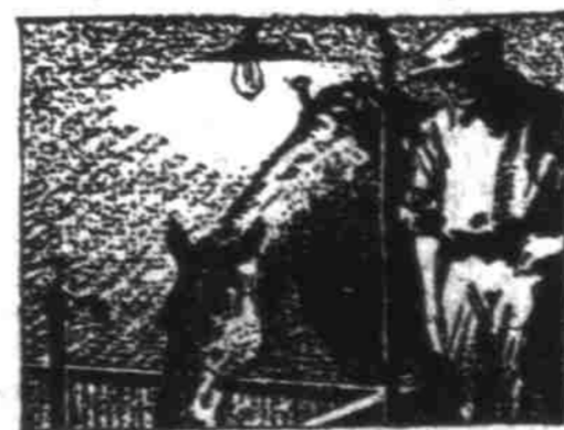
WILLYS LIGHT Certified Electric Service provides clean, pure water continuously for the stock without any labor or wasting a minute of your time.