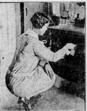
Keep the Back Straight When Looking Into Oven.

Home demonstration agents in Illinois and other states are stressing good posture in doing housework as contributing to the health of the homemaker. They recommend, as a remedy for the tired feeling due to stooping down many times to look into the