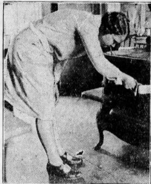
Don't Stoop to Look at Your Cape.

Those who cook on a gas or electric range or on an oil stove which has its oven set above the burners, do not have to stoop to reach the oven. But the coal or wood range which is so much used in farm homes generally has the oven alongside of the firebox below the level of the top of the stove. The housewife who has a batch of bread, a cake, pie, roast, or anything else in the oven, may find that, because of constantly stooping to watch