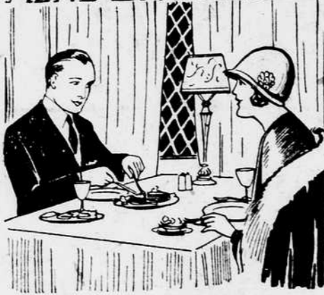
EAT AND BE MERRY

If you enjoy eating amid pleasant surroundings ours is the restaurant you are looking for. The dishes we serve are well cooked and carefully served. Our table appointments are pleasing and the atmosphere of our place is inviting. Come and take a meal with us and be convinced.