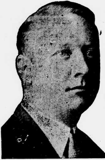
Senator Robert R. Reynolds