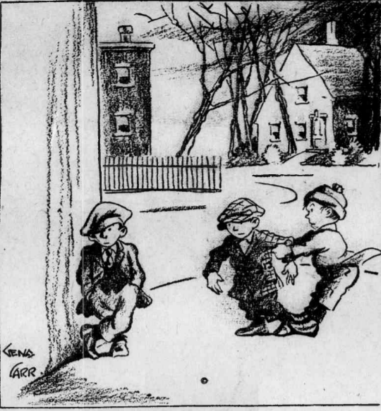
"Don't Go Near Him, Teacher Says He's Got th' Temperment!"