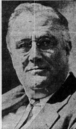
Franklin D. Roosevelt