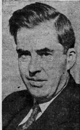
Henry A. Wallace