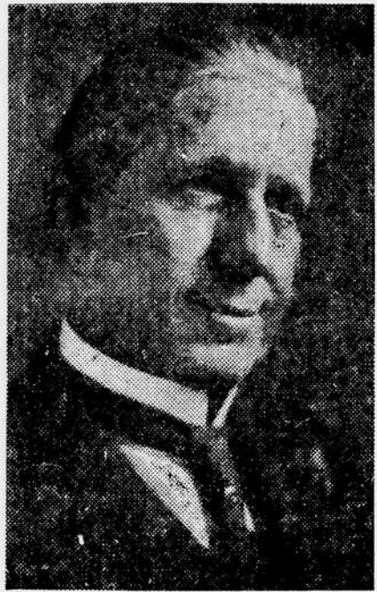
TO SPEAK HERE—Hon. Clyde R. Hoey, former governor and Democratic nominee for U. S. Senator, will speak next Wednesday night at 8 o'clock.