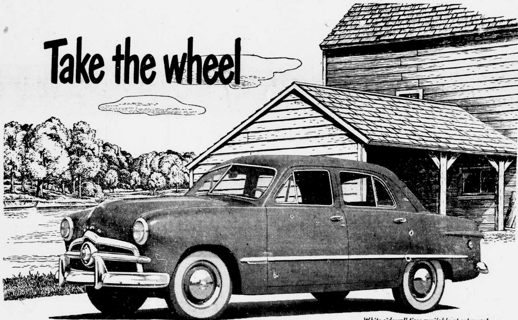
White sidewall tires available at extra cost.