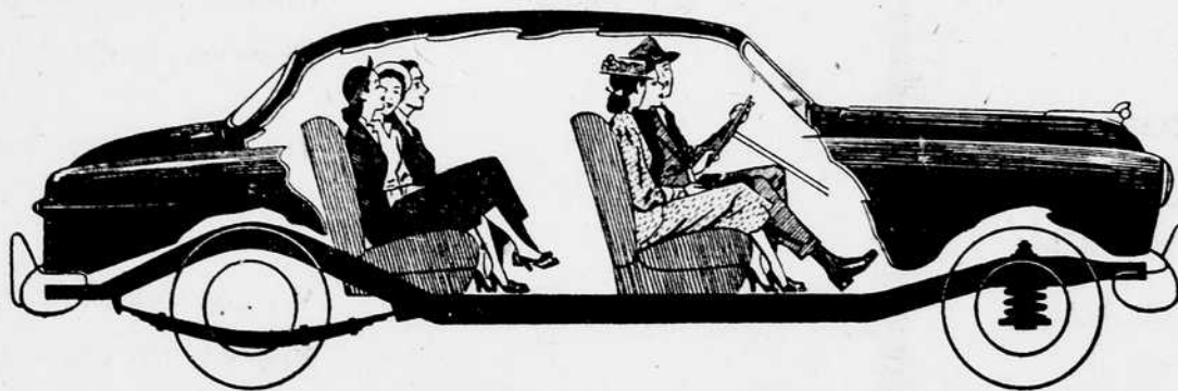
Cutaway view shows the "Mid Ship" Ride and brand-new springs that let the wheels step over bumps!

Your Ford Dealer invites you to listen to the Fred Allen Show, Sunday Evenings—NBC Network. Listen to the Ford Theater, Friday Evenings—CBS Network. See your newspaper for time and station.