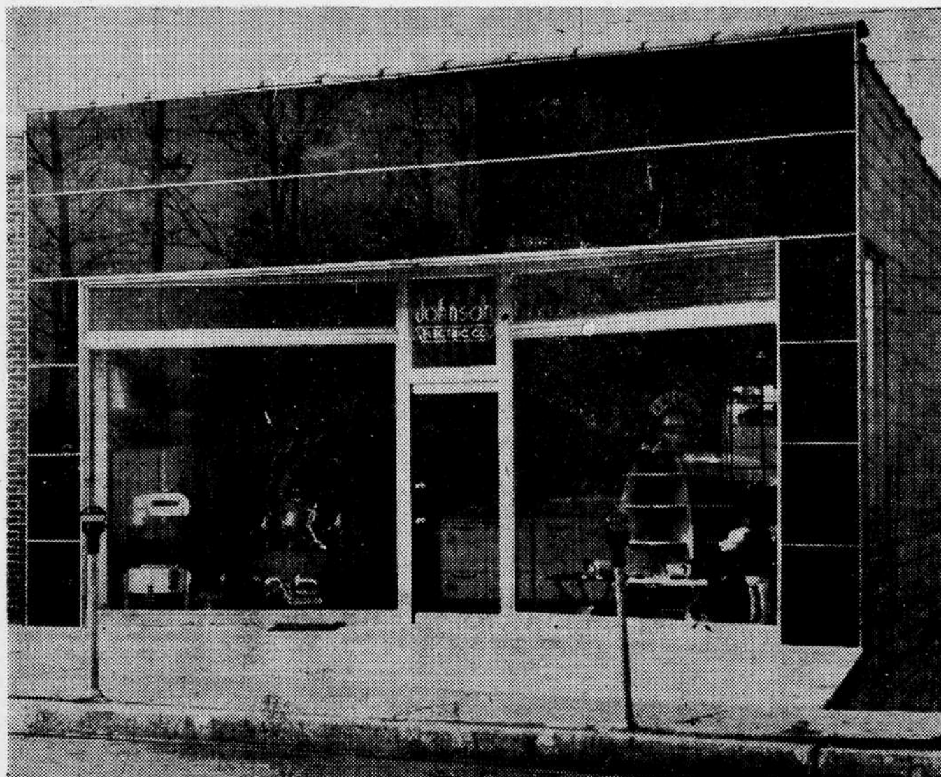
FORMAL OPENING of the Johnson Electric Company will be held Friday of this week at its new home on South Main street. The modernistic black front frames plate glass windows slanted toward the doorway. Other views of the building are shown in photos contained in an ad in this issue. (Photo by Eckenrod).