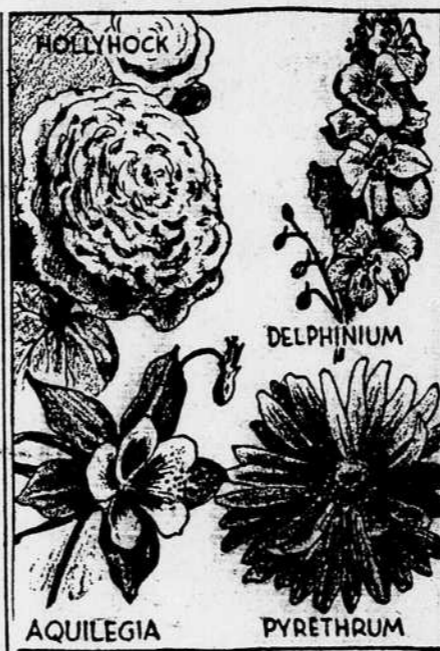
Four Popular Perennials Grown From Seed.

If you have vegetable plot, perennials can be grown there and given the same feeding and cultivation. Most of them are as easy to grow as the vegetables.